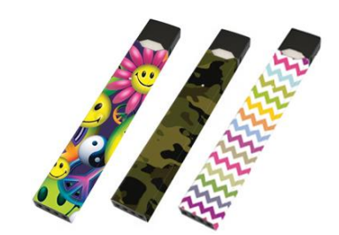
JUUL skins.

According to data from Wells Fargo, JUUL's popularity has grown dramatically in the last year, representing 46.8% of the market share in the last quarter of 2017, compared to 25% at the same point in 2016. As a result, JUUL is now more popular than the e-cigarette brands manufactured by the major tobacco companies (blu, Vuse, and MarkTen).<sup>3</sup>